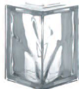
Clear Cloudy Corner