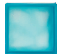
Satin Marine Blue